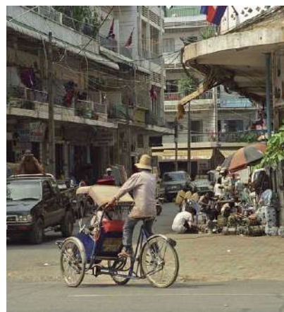
Streets of Phnom-Penh