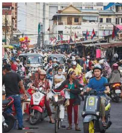
Streets of Phnom-Penh