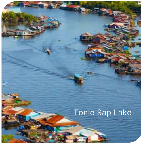
Tonle Sap Lake